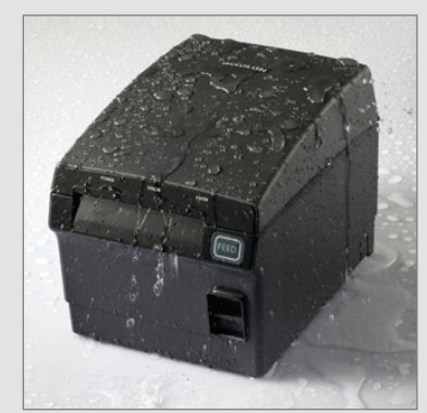
IPX2 Class certified